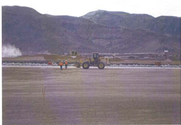
CAMU: BMI Landfill North, First lift push-out and sub-grade preparation.