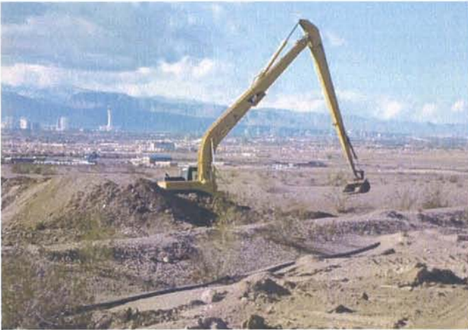
East Side: Mixing wet material into the dry ponds