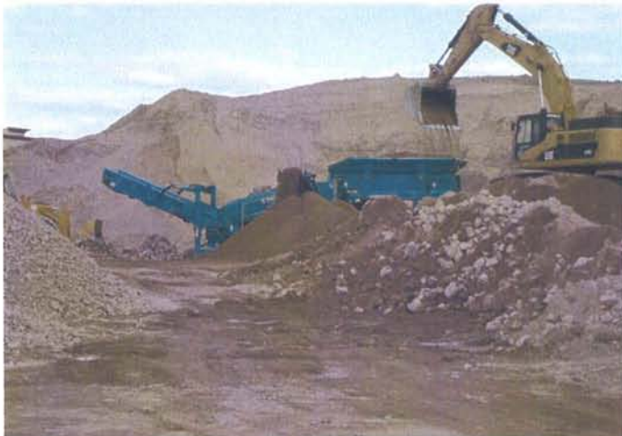
CAMU: 200,000cy stockpile, screening of 1-inch minus.