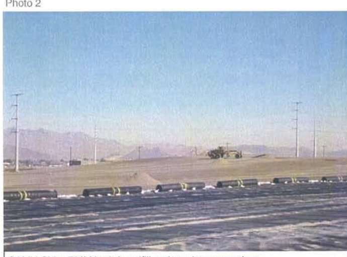
CAMU Side: BMI North Landfill, subgrade preparation.