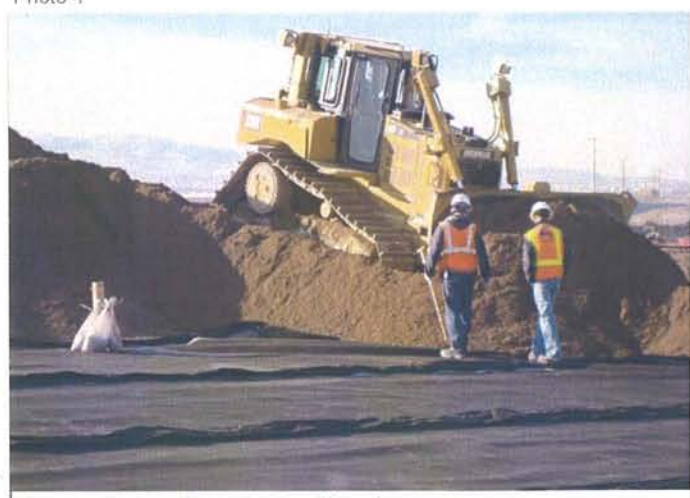
CAMU: BMI Landfill North, First lift push-out.