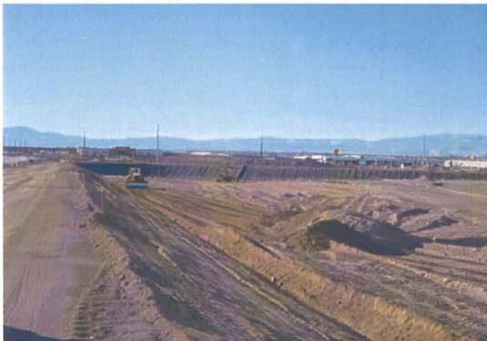
CAMU: Phase IIIA, grading. Looking west.