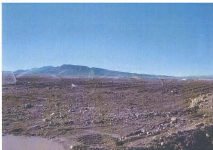
Eastside: PUD-4, Moisture conditioning.