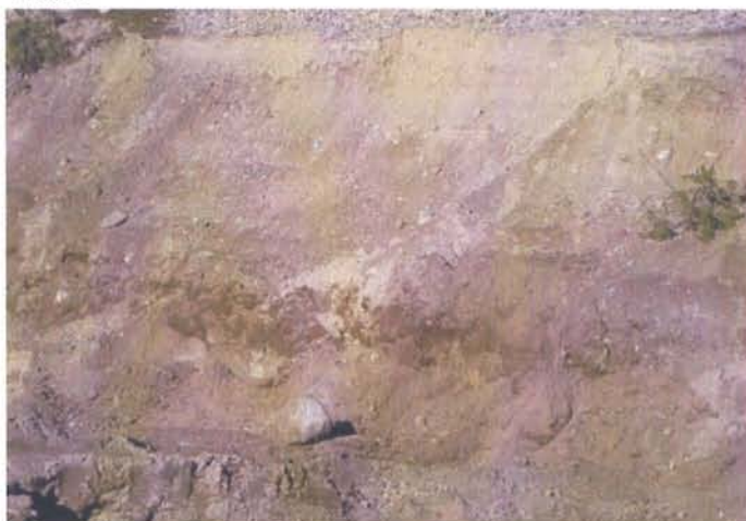
Eastside: Discolored soils in PUB-4..