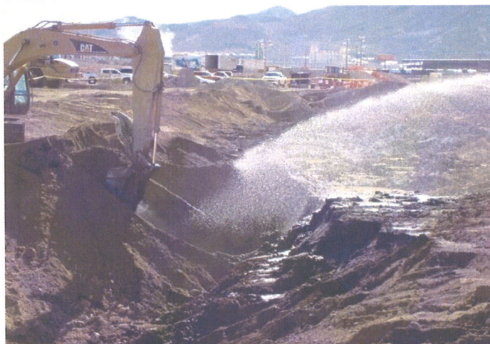
CAMU: NW Basin/Phase IIIB trench excavation, looking south.