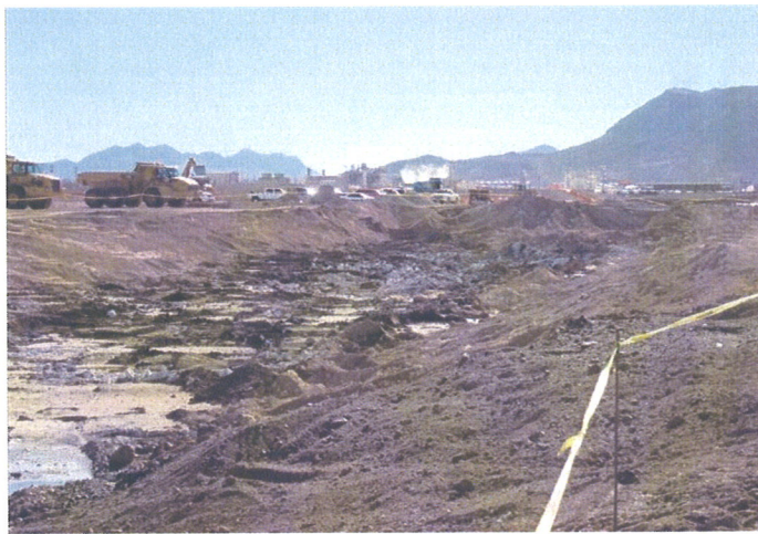
CAMU: NW Basin/Phase IIIB trench excavation, looking south.