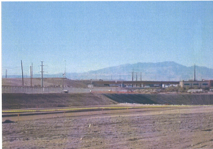
CAMU: Phase IIIA, subgrade preparation looking southwest.