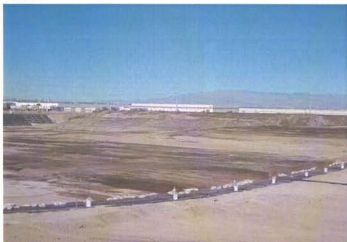
CAMU: Phase II waste placed, looking Northwest.