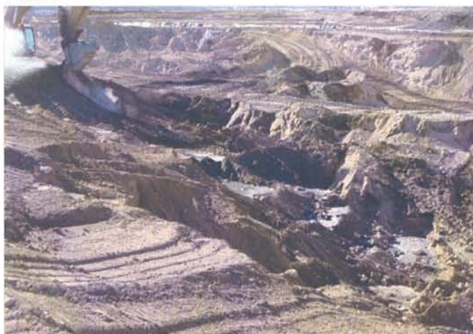
CAMU: NW Basin/Phase IIIB trench excavation.