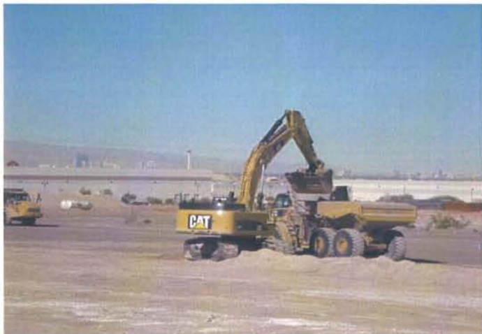
CAMU: Phase IV & V, Scrape.